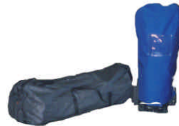
Compact storage and easy transport