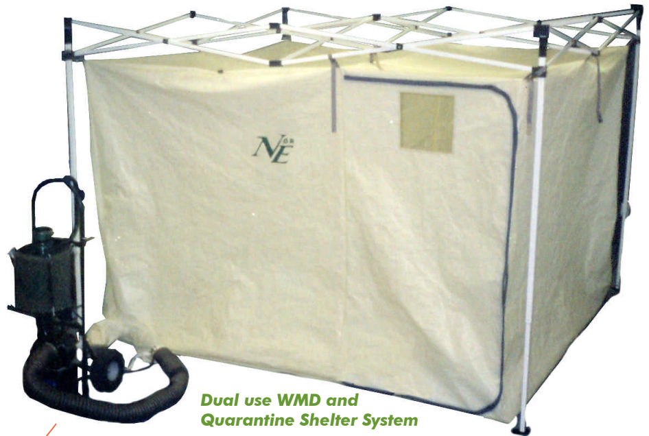
Dual use WMD and Quarantine Shelter System