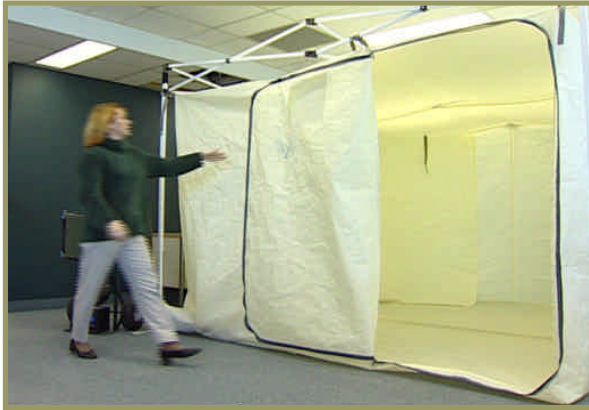
Protective WMD shelter can be deployed anywhere.

The Nor E Home & Office Shelter System is a quick erect structure for home or office protection from chemical, biological and radiological contamination.