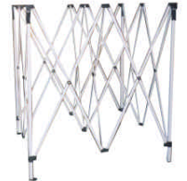
Lightweight sturdy frames for quick setup